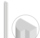
QUADRANT END MOULDING 3050 X 70 X 50