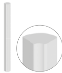
30MM CORNERPOST 720 X 30 X 30