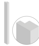
UNIVERSAL MOULDING 35 X 3050 X 60