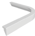
QUADRANT LIGHT PELMET 55 X 430 X 430