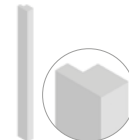
UNIVERSAL MOULDING 35 X 3050 X 60