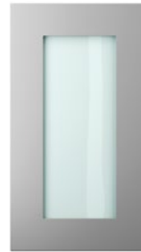
PLAIN FRAME includes clear glass