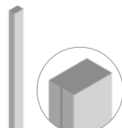
TALL FEATURE END POST NEW 3000 X 50 X 75